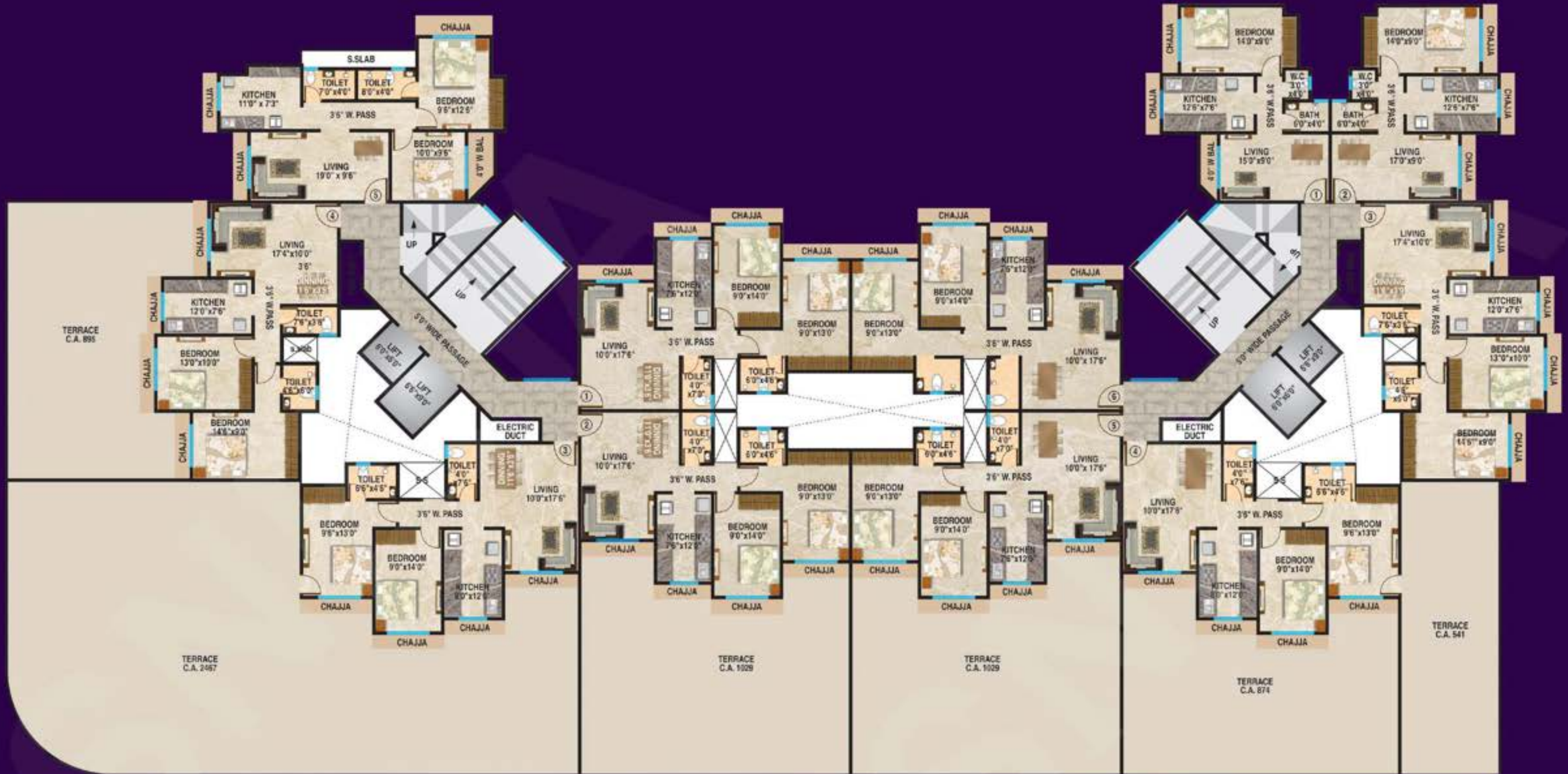
2nd Floor Plan BUILDING NO.1 WING A & B