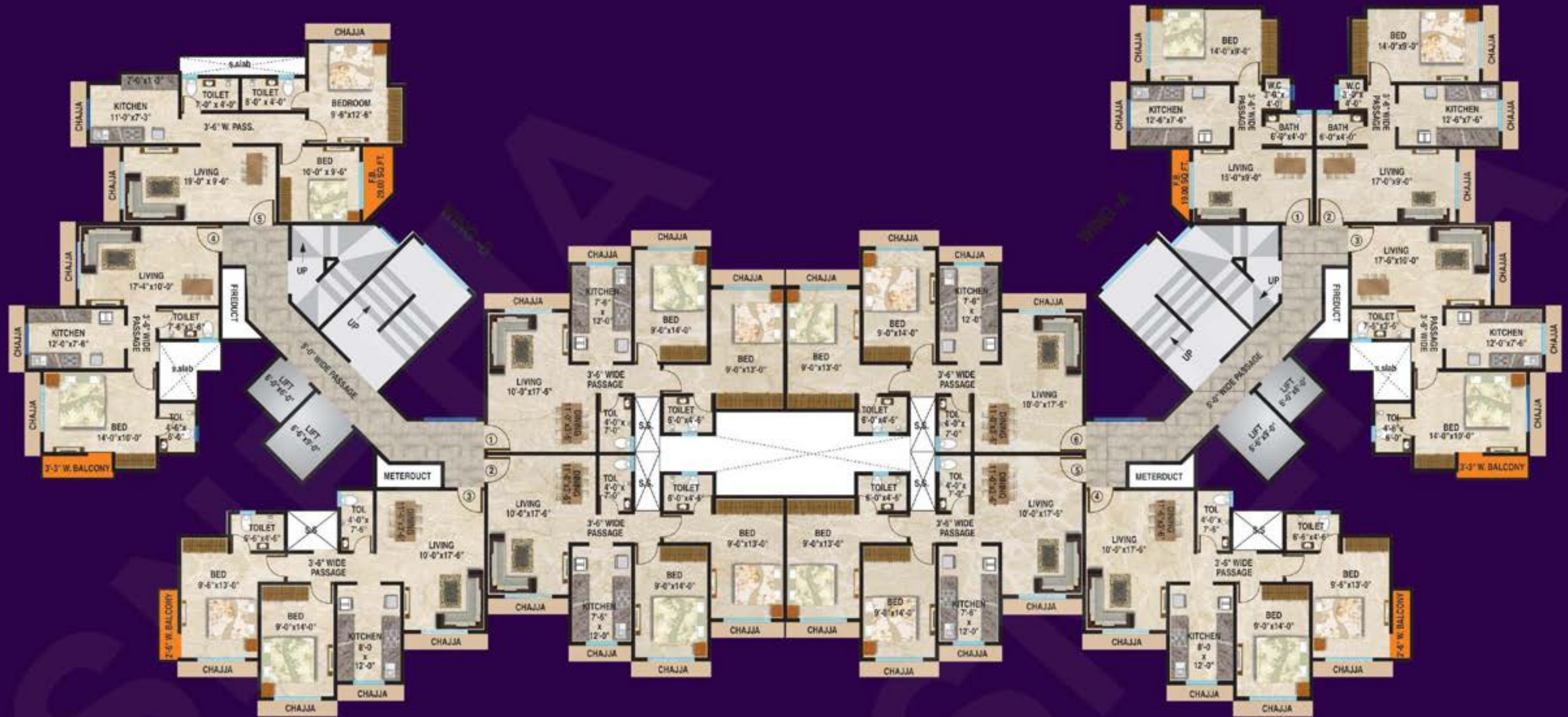
Typical Floor Plan BUILDING NO. 1 WING A & B